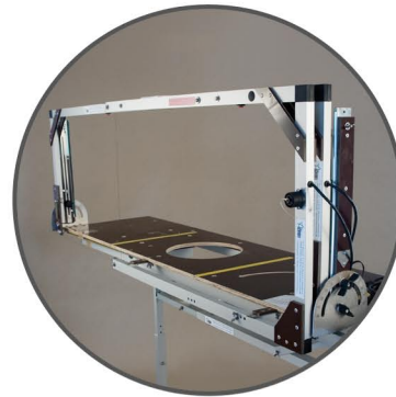
The cutting tool type L-G-S 135R with cutting bow VH 135.