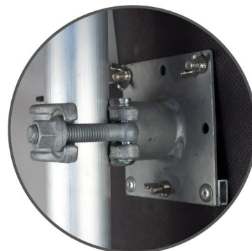
The scaffolding mount is quickly attached to the cutting tools via three screws.