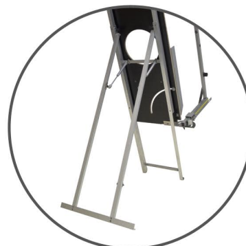
The cutting tool can be firmly connected to the tool stand.